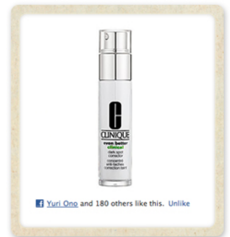
The "Like Button" on Sephora's product pages