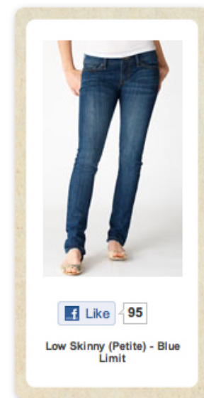
The “Like Button” on Levi’s product pages