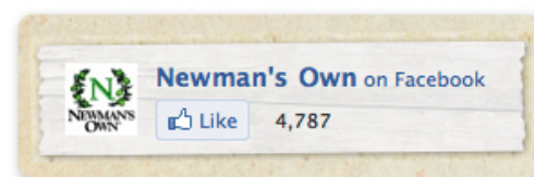
Showing the number of Newman's Own fans via the “Like Box” plugin