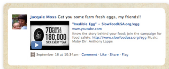
Link sharing on Facebook